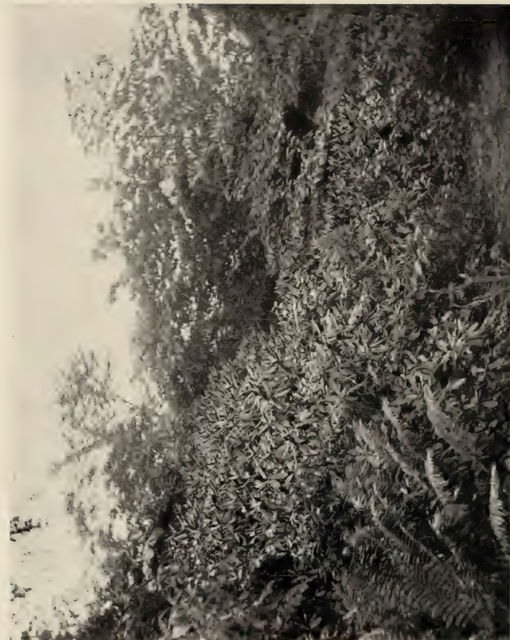
MASSING OF RHODODENDRON MAXIMUM.